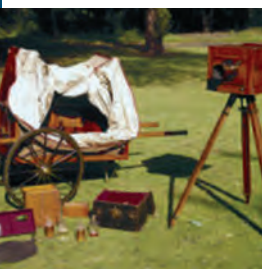
Traveling glass plate photography equipment

squeezing the bulb, a small burst of air is used to blow loose dust and debris away. This cleaning method can be used for both the emulsion side and the glass side of the negative.