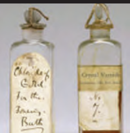
Self-applied liquid collodion