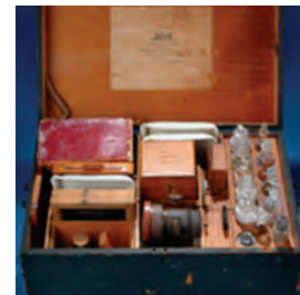
Glass plate photography field kit

MicroChamber and MicroChamber/Silversafe negative enclosures are available through Conservation Resources International, LLC, 8000-H Forbes Place, Springfield, VA 22151. Telephone: (800) 634-6932. For more information: www.conservationresources.com